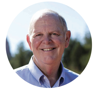
Tom O'Halleran (AZ-01) $9.7 M