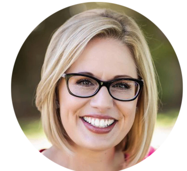
Kyrsten Sinema (AZ-09) $17 K