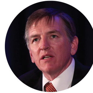
Paul Gosar (AZ-04) $10.2 M