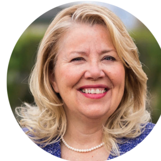
Debbie Lesko (AZ-08) $1.9 M