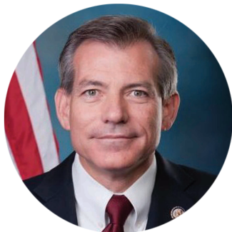
David Schweikert (AZ-06) $8.9 M