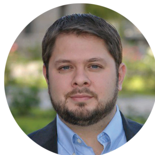
Ruben Gallego (AZ-07) $2.4 M