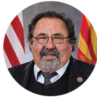
Raúl M. Grijalva (AZ-03) $9.7 M