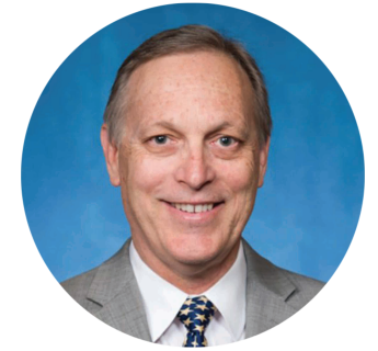
Andy Biggs (AZ-05) $9.7 M