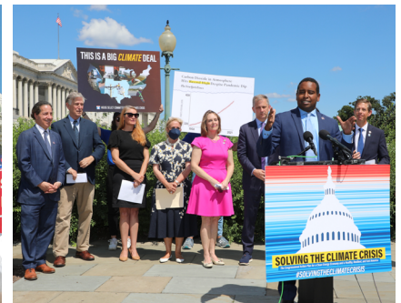
2022: Inflation Reduction Act press event to celebrate victory

After this devastating loss in 2010, LCV took stock of our approach to passing legislation. We learned that we had to build political power for the environmental movement if we wanted to overcome the dominating influence of fossil fuel interests and successfully persuade Congress to take the climate crisis seriously.