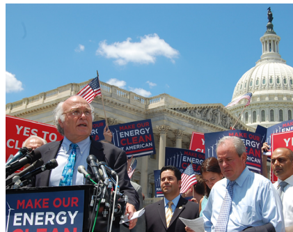
2009: American Clean Energy and Security Act rally

With the sustained support of our donors, LCV worked for more than a decade to press elected leaders to take bold action on the existential crisis of climate change. Prior to 2022, we made robust attempts to pass federal climate legislation but ultimately fell short, including in 2010, when the imperfect but viable American Clean Energy and Security Act (also known as the “Waxman-Markey bill”) failed to pass the U.S. Senate.